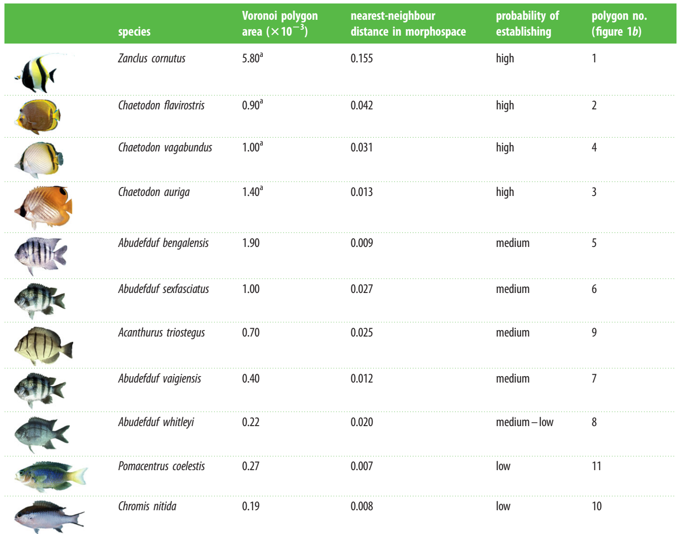
Table 2. Predicted likelihood of range expansion by tropical vagrant fish species into temperate marine communities of the southeast coast of Australia, based on morphology alone.

a Conservative estimate of niche space owing to constraint of convex hull boundary.